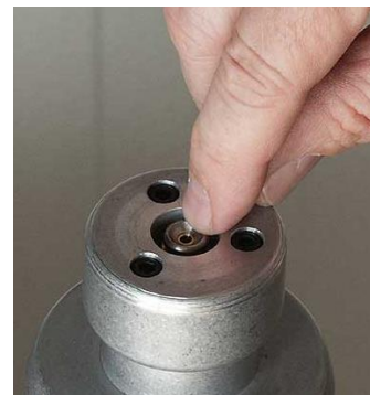
Lift-Off Coreholder Quick Deflation Valve