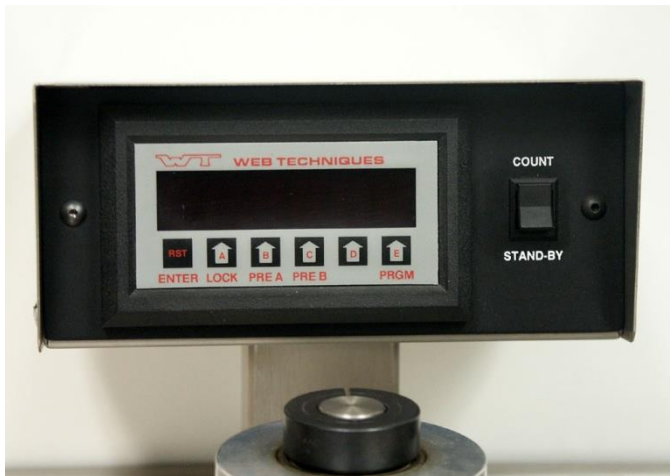
Figure 2 Counter Package